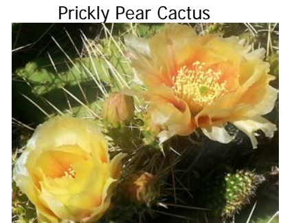
Prickly Pear Cactus

Each garden club participating in this project will receive a butterfly garden flag in addition to the certificate of participation.